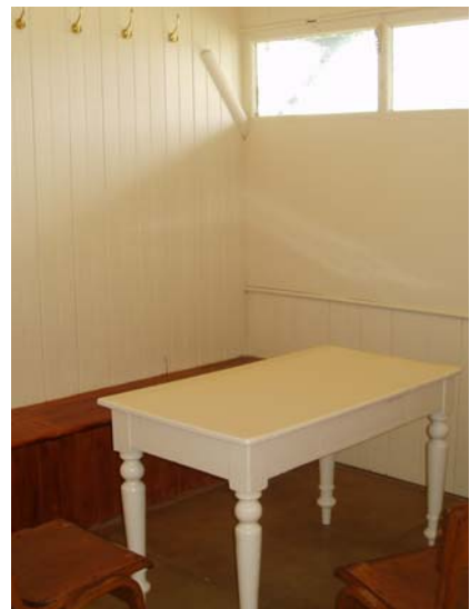
Figure 5: Changing Area After