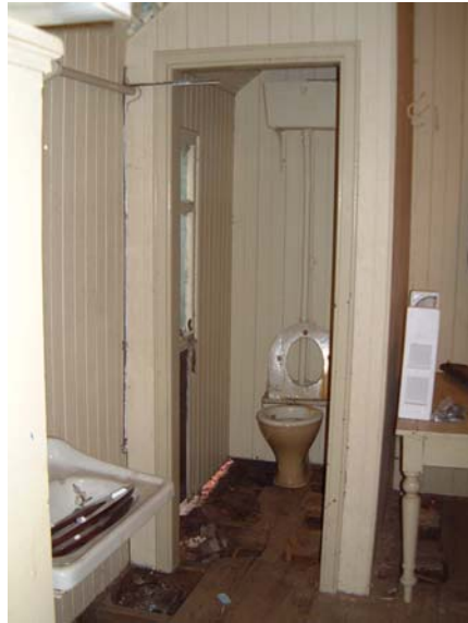
Figure 2: Toilet Before

To help illustrate the impact of this project and the funding support from North County the following series of pictures are included in this report.