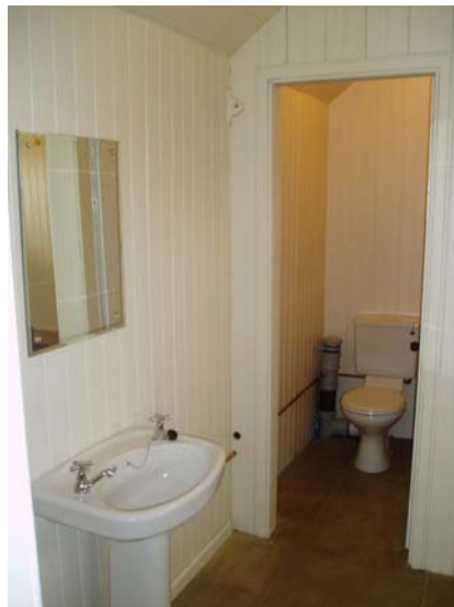
Figure 4: Toilet After